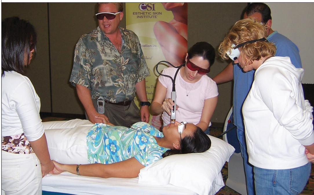
▲ Esthetic Skin Institute provides courses for doctors, nurses and physician assistants.

Her plans changed, however, after an encounter with a physician at the facility where she worked. Observing his high degree of stress and fatigue, she suggested that he consider incorporating skin care into his practice, explaining the advantages and benefits of doing so. At the time, the concept of aesthetic medicine was so new that the MD was uncertain and declined. Later, after attending one of her educational presentations, he invited her to meet with him and his partner. Convinced of the